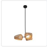
CH20625-BK/OP Black/Opal Matte Glass